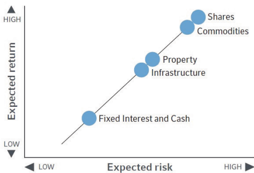
Position on risk/return spectrum