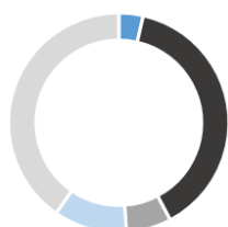
Asset allocation as at 31 March 2022 2