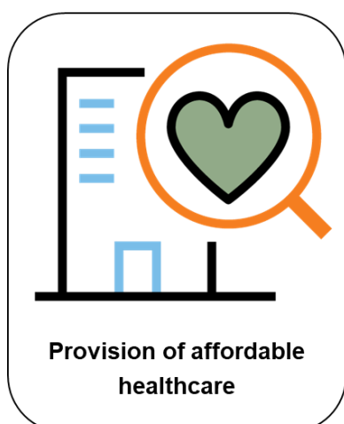
Exhibit 2: Examples of impact investing

The growing involvement of large-scale and mainstream firms also presents a surmountable risk, namely the risk of 'impact washing' — i.e. when actors adopt the label without meaningful loyalty to investors' societal goals. Encouragingly, impact investors are aware of this risk and are beginning to emphasise the importance of greater transparency around impact investing when underwriting a commitment.