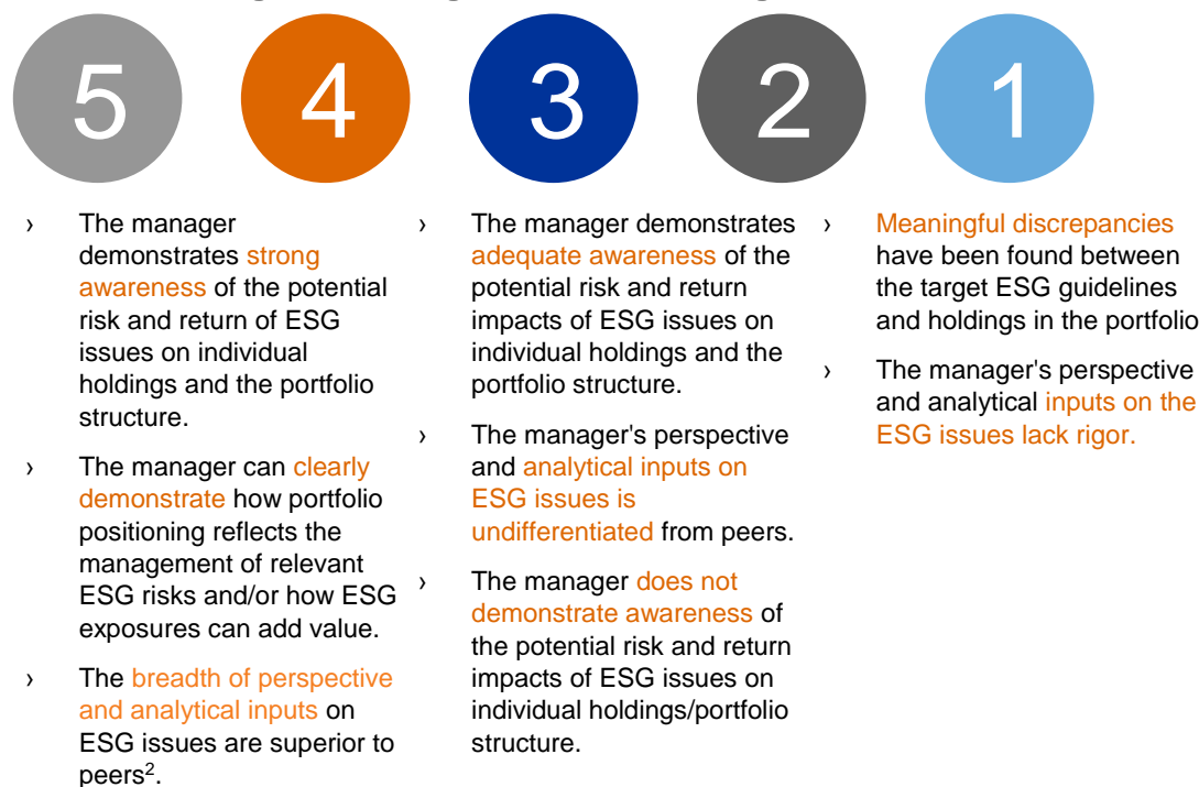
Exhibit 1: Ranking active managers on their ESG integration

ESG awareness and integration is not about restricting securities, targeting ESG or climate-related metrics of any sort, or even intentionally investing in securities with better environment, social or governance practices. But rather, such awareness and integration is about understanding how E, S and G impact a firm, and will impact the future direction of a security's price.